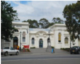
FORMER HEATHCOTE COURT HOUSE AND SHIRE COUNCIL CHAMBERS SOHE 2008