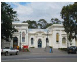
FORMER HEATHCOTE COURT HOUSE AND SHIRE COUNCIL CHAMBERS SOHE 2008