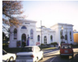
1 former heathcote court house & shire council chambers front view