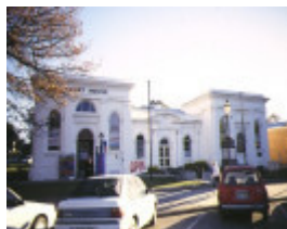
1 former heathcote court house & shire council chambers front view