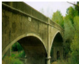
bridge over moorabool river fyansford front elevation publication