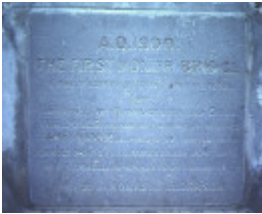
bridge over moorabool river fyansford dedication stone jul1984