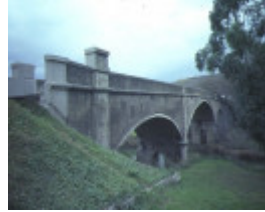
1 bridge over moorabool river fyansford side view jul1984