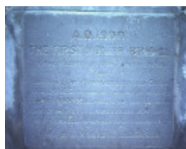
bridge over moorabool river fyansford dedication stone jul1984