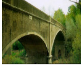
bridge over moorabool river fyansford front elevation publication