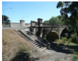
BRIDGE SOHE 2008