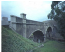
1 bridge over moorabool river fyansford side view jul1984