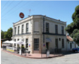
FYANSFORD HOTEL SOHE 2008