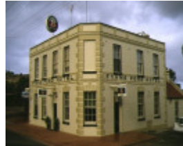
1 fyansford hotel fyansford front corner view apr1997