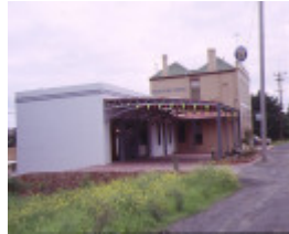
fyansford hotel fyansford rear view