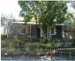
BARWON PAPER MILL COMPLEX SOHE 2008