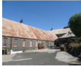
BARWON PAPER MILL COMPLEX SOHE 2008