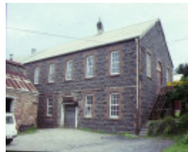
barwon paper mill complex fyansford bluestone building