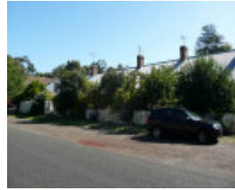
BARWON PAPER MILL COMPLEX SOHE 2008