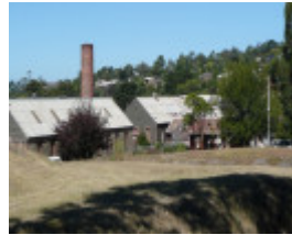
BARWON PAPER MILL COMPLEX SOHE 2008