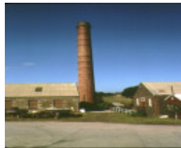
barwon paper mill complex fyansford chimney