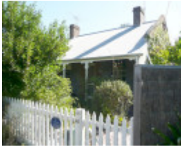
BARWON PAPER MILL COMPLEX SOHE 2008