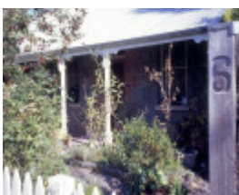
barwon paper mill complex lower paper mills road fyansford no 42 workers cottage close up she project 2003