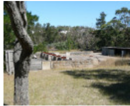
BARWON PAPER MILL COMPLEX SOHE 2008