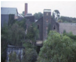
1 barwon paper mill complex fyansford view of property