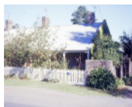
barwon paper mill complex lower paper mills road fyansford no 42 workers cottage front view she project 2003