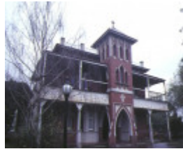
st james church gardenvale front view of rectory jul78