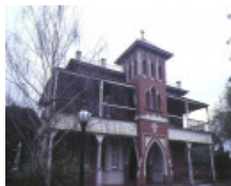
st james church gardenvale front view of rectory jul78