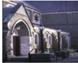
st james church gardenvale north entrance jul1978