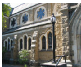
ST. JAMES CHURCH AND PRESBYTERY SOHE 2008