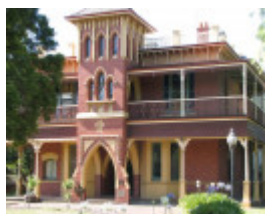
ST. JAMES CHURCH AND PRESBYTERY SOHE 2008