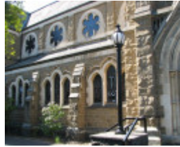
ST. JAMES CHURCH AND PRESBYTERY SOHE 2008