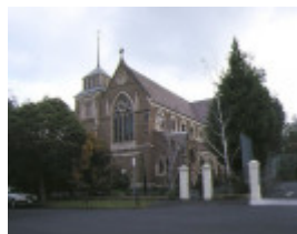
1 st james church gardenvale front view jul1992