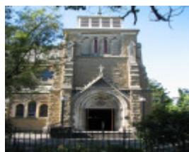
ST. JAMES CHURCH AND PRESBYTERY SOHE 2008