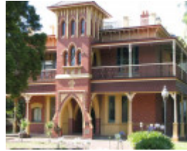
ST. JAMES CHURCH AND PRESBYTERY SOHE 2008