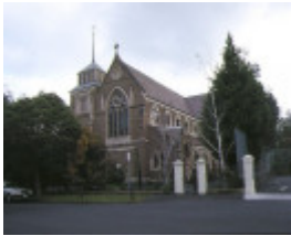
1 st james church gardenvale front view jul1992