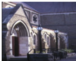
st james church gardenvale north entrance jul1978