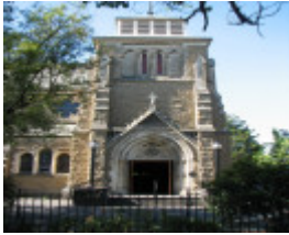
ST. JAMES CHURCH AND PRESBYTERY SOHE 2008