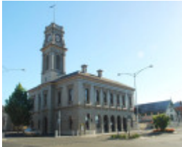
CASTLEMAINE POST OFFICE SOHE 2008