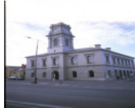
1 castlemaine post office barker street castlemaine front view jun1997