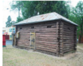
EAGLEHAWK COURT HOUSE AND LOG LOCK-UP SOHE 2008