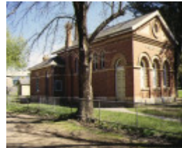
1 eaglehawk courthouse magistrates court & lockup courthouse front corner