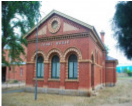
EAGLEHAWK COURT HOUSE AND LOG LOCK-UP SOHE 2008