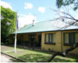
ELLERSLIE SOHE 2008