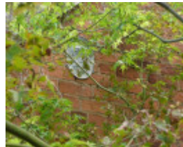
ELLERSLIE SOHE 2008