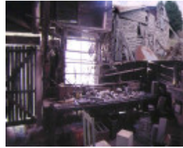
1 blacksmiths shop & residence hale street strathbogie residence