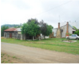
BLACKSMITHS SHOP AND RESIDENCE SOHE 2008