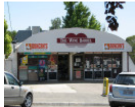
CTESIPHON CONCRETE SUPERMARKET AND RESIDENCE SOHE 2008