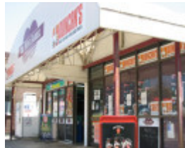
CTESIPHON CONCRETE SUPERMARKET AND RESIDENCE SOHE 2008