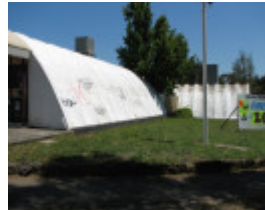
CTESIPHON CONCRETE SUPERMARKET AND RESIDENCE SOHE 2008