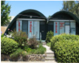
CTESIPHON CONCRETE SUPERMARKET AND RESIDENCE SOHE 2008