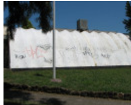
CTESIPHON CONCRETE SUPERMARKET AND RESIDENCE SOHE 2008