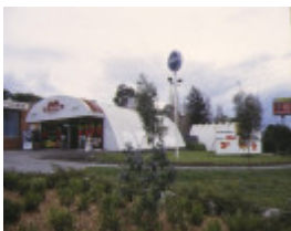
1 ctesiphon concrete supermarket & residence high street ashwood property view