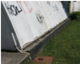
CTESIPHON CONCRETE SUPERMARKET AND RESIDENCE SOHE 2008