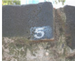
YARRA BANK (SPEAKERS CORNER) SOHE 2008