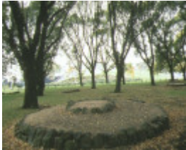
1 yarra bank speakers corner batman avenue melbourne view of speakers rings