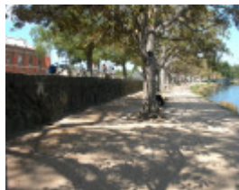
YARRA BANK LOOKING TOWARDS SPEAKERS CORNER SOHE 2008