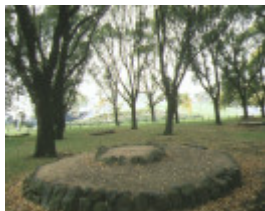
1 yarra bank speakers corner batman avenue melbourne view of speakers rings