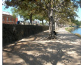
YARRA BANK LOOKING TOWARDS SPEAKERS CORNER SOHE 2008