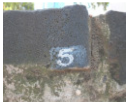
YARRA BANK (SPEAKERS CORNER) SOHE 2008