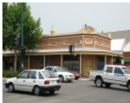
FORMER BUSH'S STORE SOHE 2008