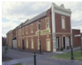
1 former bush's store bendigo shop front 1998