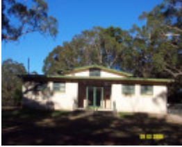
52353 Memorial Hall HOtspur 061