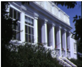
merchiston hall garden street geelong front entrance