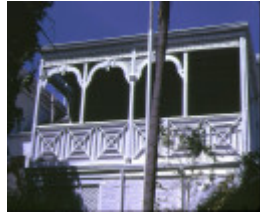
merchiston hall garden street geelong balcony detail view