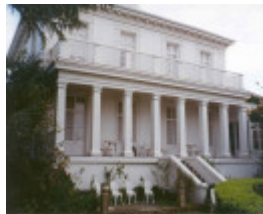
h00192 merchiston hall garden street geelong rear