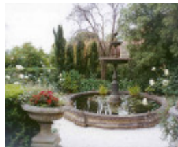
h00192 merchiston hall garden street geelong fountain