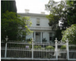
MERCHISTON HALL SOHE 2008