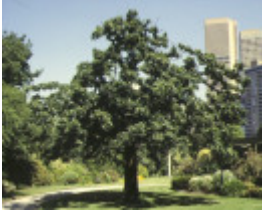
1 federal oak parliament house gardens melbourne front view