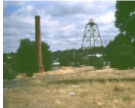
1 north deborah mine bendigo site view feb1990