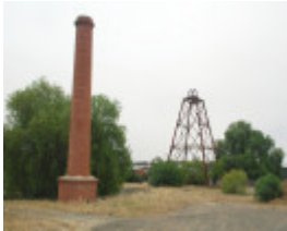
NORTH DEBORAH QUARTZ GOLD MINE SOHE 2008