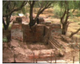
1 south german quartz gold mine boundary road maldon front view