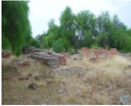
SOUTH GERMAN QUARTZ GOLD MINE SOHE 2008