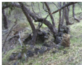
1 lises & mantons gullies quartz gold mine maldon blacksmith shop