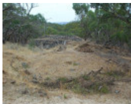
LISLES AND MANTONS GULLIES QUARTZ GOLD MINES SOHE 2008