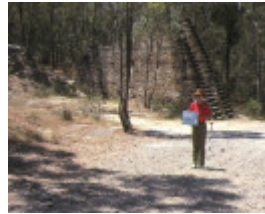
1 garfield waterwheel quartz gold mining site quartz hill track chewton front view jan1990