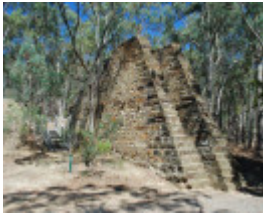
GARFIELD WATERWHEEL QUARTZ GOLD MINING SITE SOHE 2008