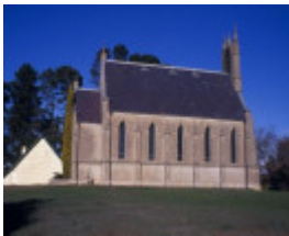
h01350 holy trinity anglican church and sunday school davy street taradale north face she project 2003