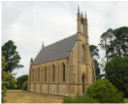
HOLY TRINITY ANGLICAN CHURCH AND SUNDAY SCHOOL HALL SOHE 2008