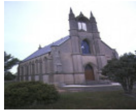
1 holy trinity anglican church and sunday school davy street taradale front view