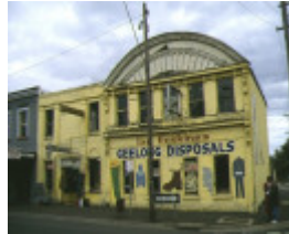
1 former brown bros iron store mercer street geelong front view