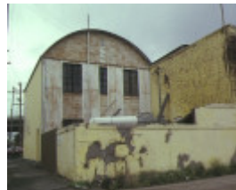
former brown bros iron store mercer street geelong rear view