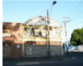
IRON STORE SOHE 2008