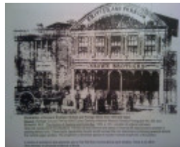
Old front shop-Iron Store.JPG