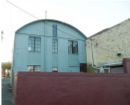
IRON STORE SOHE 2008