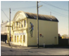
former brown bros iron store mercer street geelong side view