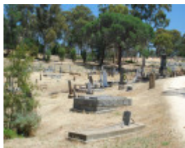
CASTLEMAINE PUBLIC CEMETERY (CAMPBELL'S CREEK) SOHE 2008