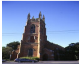
1 st pauls church of england geelong front view