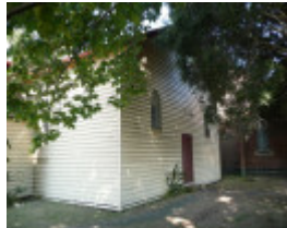
ST PAULS CHURCH OF ENGLAND SOHE 2008