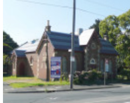
ST PAULS CHURCH OF ENGLAND SOHE 2008