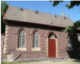
ST PAULS CHURCH OF ENGLAND SOHE 2008