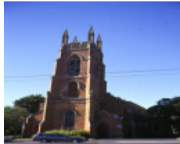
1 st pauls church of england geelong front view