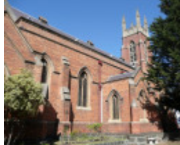
ST PAULS CHURCH OF ENGLAND SOHE 2008