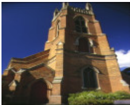
st pauls church of england geelong bell tower