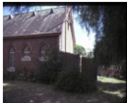
st pauls church of england geelong kindergarten hall