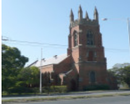
ST PAULS CHURCH OF ENGLAND SOHE 2008