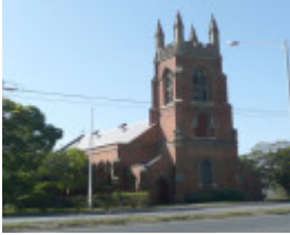
ST PAULS CHURCH OF ENGLAND SOHE 2008