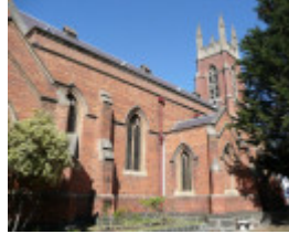
ST PAULS CHURCH OF ENGLAND SOHE 2008