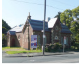
ST PAULS CHURCH OF ENGLAND SOHE 2008