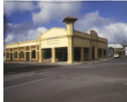
1 a j thomas motor garage camperdown front view sep1997