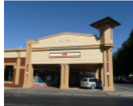
AJ THOMAS MOTOR GARAGE SOHE 2008