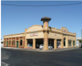
AJ THOMAS MOTOR GARAGE SOHE 2008