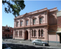
THEATRE ROYAL AND MECHANICS INSTITUTE SOHE 2008