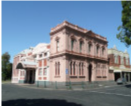
THEATRE ROYAL AND MECHANICS INSTITUTE SOHE 2008