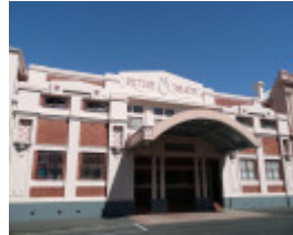
THEATRE ROYAL AND MECHANICS INSTITUTE SOHE 2008