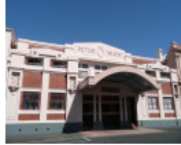
THEATRE ROYAL AND MECHANICS INSTITUTE SOHE 2008