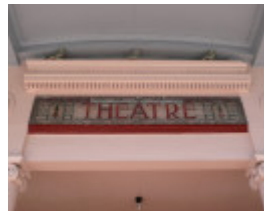
THEATRE ROYAL AND MECHANICS INSTITUTE SOHE 2008