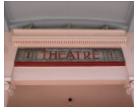
THEATRE ROYAL AND MECHANICS INSTITUTE SOHE 2008