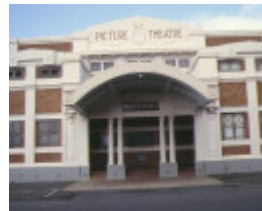
1 theatre royal & mechanics institute camperdown front view of theatre