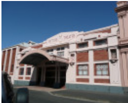
THEATRE ROYAL AND MECHANICS INSTITUTE SOHE 2008