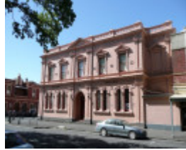
THEATRE ROYAL AND MECHANICS INSTITUTE SOHE 2008