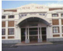
1 theatre royal & mechanics institute camperdown front view of theatre