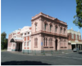
THEATRE ROYAL AND MECHANICS INSTITUTE SOHE 2008