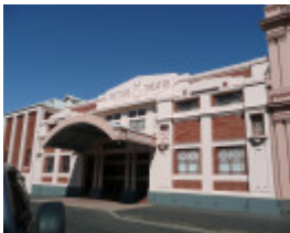
THEATRE ROYAL AND MECHANICS INSTITUTE SOHE 2008