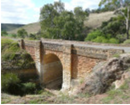
BRIDGE SOHE 2008