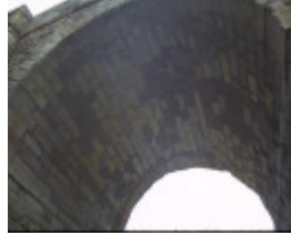
bridge over djerriwarrh creek bacchus marsh arch detail sep1984