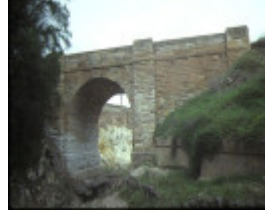
1 bridge over djerriwarrh creek bacchus marsh front elevation sep1984