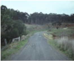
bridge over djerriwarrh creek bacchus marsh view of road sep1984