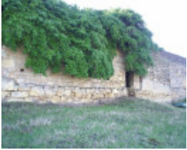
53002 Yannarie Butter Factory 2