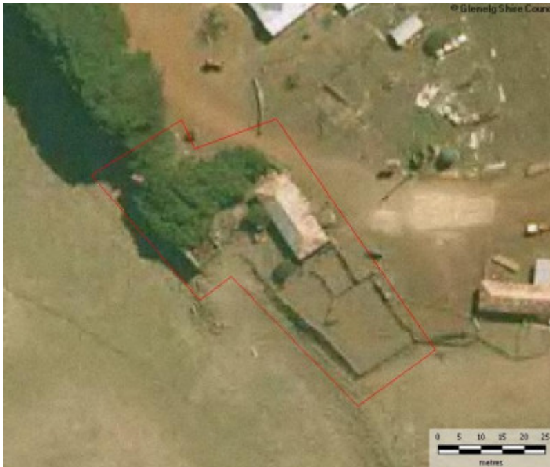
MAP 1 - Extent of Registration