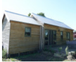
TIMBOON HOUSE SOHE 2008