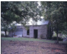
h01387 timboon house old geelong road camperdown original stables she project 2003