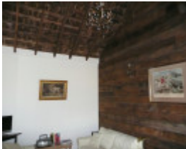
TIMBOON HOUSE SOHE 2008