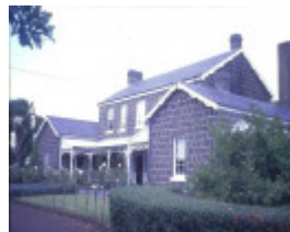
h01387 timboon house old geelong road camperdown west side she project 2003