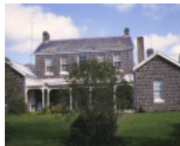
h01387 timboon house camperdown front view sep1997