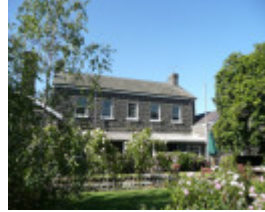
TIMBOON HOUSE SOHE 2008