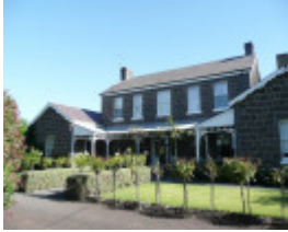
TIMBOON HOUSE SOHE 2008