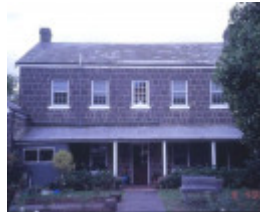
h01387 timboon house old geelong road camperdown back of house she project 2003