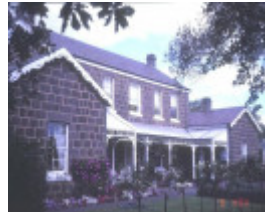
h01387 1 timboon house old geelong road camperdown front drive she project 2003