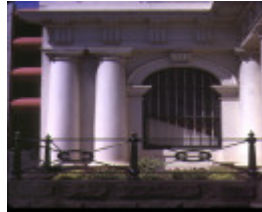
trustees chambers malop street geelong iron work