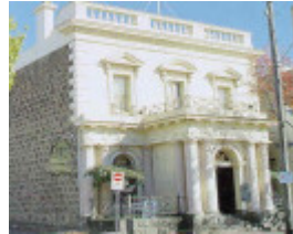
trustees chanbers malop street geelong front detail publication