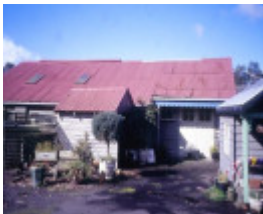
camperdown steam laundry paton street camperdown shed she project 2003