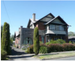
CAMPERDOWN STEAM LAUNDRY SOHE 2008