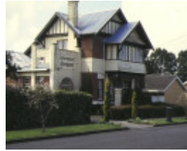
1 camperdown steam laundry front view sep1997