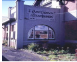
camperdown steam laundry paton street camperdown front sign she project 2003