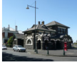
CAMPERDOWN POST OFFICE SOHE 2008