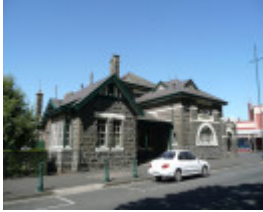
CAMPERDOWN POST OFFICE SOHE 2008