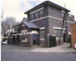
1 camperdown post office front view sep1997