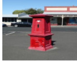
CAMPERDOWN POST OFFICE SOHE 2008