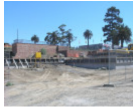
SALTWATER RIVER CROSSING SITE AND FOOTSCRAY WHARVES PRECINCT SOHE 2008