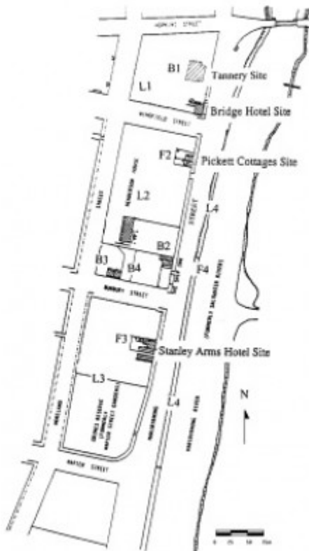
Saltwater River Crossing Site&#amp;#226;#226;#226; Footscray Wharves Precinct Plan