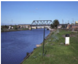
1 saltwater river crossing site & footscray wharves precinct maribyrnong river foreshore aug1988