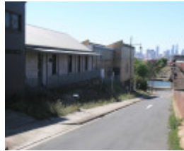
SALTWATER RIVER CROSSING SITE AND FOOTSCRAY WHARVES PRECINCT SOHE 2008