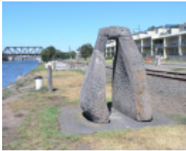
SALTWATER RIVER CROSSING SITE AND FOOTSCRAY WHARVES PRECINCT SOHE 2008