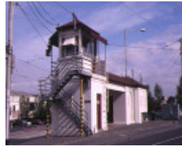
1 tramway signal cabin waiting shelter & conveniences swanston street malbourne stair view jan1998