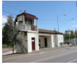
Swanston Street Tramway Signal Cabin February 2002