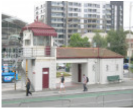
TRAMWAY SIGNAL CABIN, WAITING SHELTER AND CONVENIENCES SOHE 2008