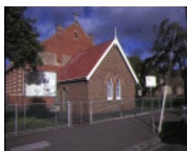
christ church geelong parish hall front