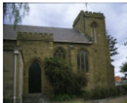
christ church mckillop street geelong church entrance side view