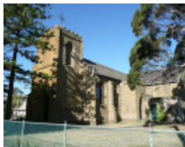
CHRIST CHURCH SOHE 2008