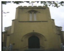
1 christ church geelong front view church