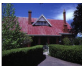
christ church geelong vicarage