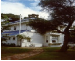
1 chalet mt martha