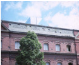
former strachan murray & shannon wool warehouse geelong view of top floor oct1987