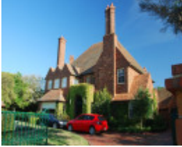
COMBE MARTIN SOHE 2008