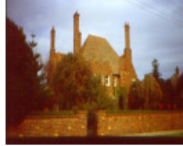
1 Combe Martin Mornington