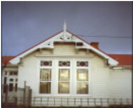
Mount Martha House