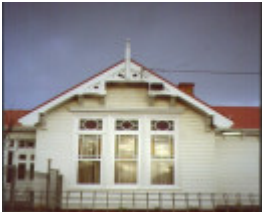
Mount Martha House