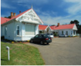
MOUNT MARTHA HOUSE SOHE 2008