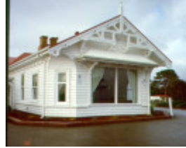
1 mount martha house