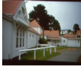
Mount Martha House