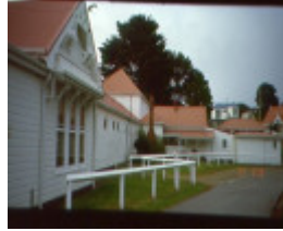
Mount Martha House