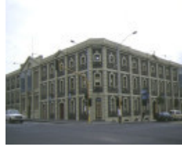
1 dennys lascelles wool stores geelong wool museum apr1997