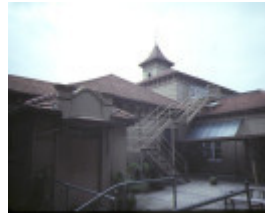
matthew flinders school number 8022 myers street geelong rear view