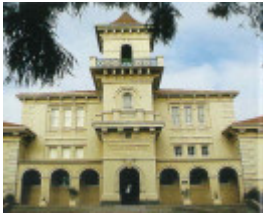
matthew flinders school number 8022 myers street geelong entrance publication