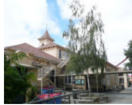
MATTHEW FLINDERS SCHOOL NO.8022 SOHE 2008