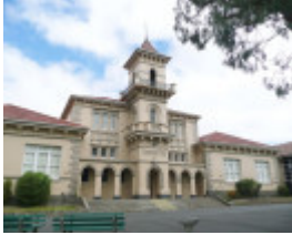
MATTHEW FLINDERS SCHOOL NO.8022 SOHE 2008