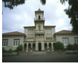
1 matthew flinders school number 8022 geelong front elevation