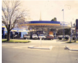
1 beaurepaire motor garage hargraves street bendigo front view