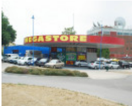
BEAUREPAIRE MOTOR GARAGE SOHE 2008