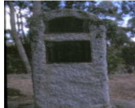
1 vaughan chinese cemetery castlemaine road vaughan detail