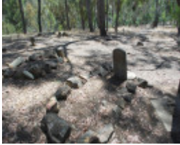
VAUGHAN CHINESE CEMETERY SOHE 2008