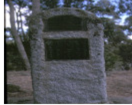
1 vaughan chinese cemetery castlemaine road vaughan detail