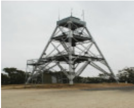
MOUNT TARRENGOWER LOOK-OUT TOWER SOHE 2008