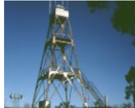
1 mount tarrengower lookout tower mount tarrengower maldon front view feb1997