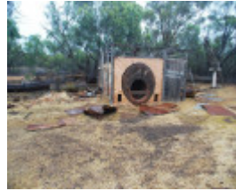
REUDINS EUCALYPTUS DISTILLERY SOHE 2008