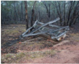
REUDINS EUCALYPTUS DISTILLERY SOHE 2008