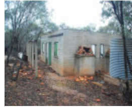
REUDINS EUCALYPTUS DISTILLERY SOHE 2008