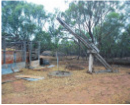
REUDINS EUCALYPTUS DISTILLERY SOHE 2008