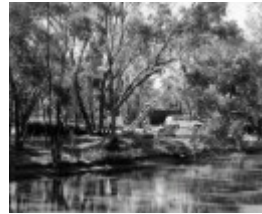
1 reudins eucalyptus distillery bendigo tennyson road bendigo view from water