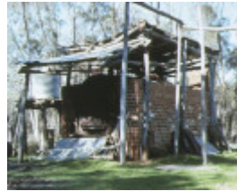
1 reudins eucalyptus distillery bendigo tennyson road bendigo front view