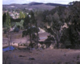
1 cemetery reef gully cemetery mount street chewton site view feb1997