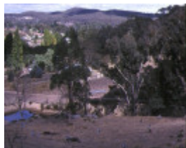
1 cemetery reef gully cemetery mount street chewton site view feb1997