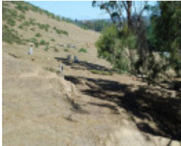
CEMETERY REEF GULLY CEMETERY SOHE 2008