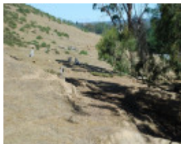
CEMETERY REEF GULLY CEMETERY SOHE 2008