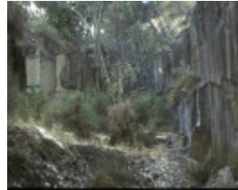
1 specimen gully flagstone quarry barkers creek castlemaine side view