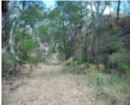
SPECIMEN GULLY FLAGSTONE QUARRY SOHE 2008