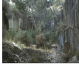
1 specimen gully flagstone quarry barkers creek castlemaine side view