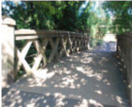
CONCRETE TRUSS FOOTBRIDGE SOHE 2008