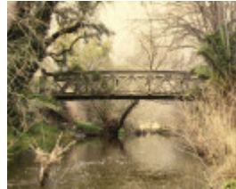
1 concrete truss footbridge over barkers creek castlemaine side view sep1997