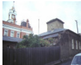
former telegraph station ryrie street geelong rear view jul1984