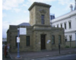
1 former telegraph station ryrie street geelong front elevation apr1997