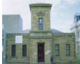
former telegraph station ryrie street geelong front view publication