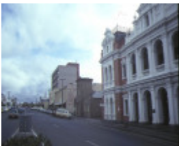
former telegraph station ryrie street geelong streetscape aug1984