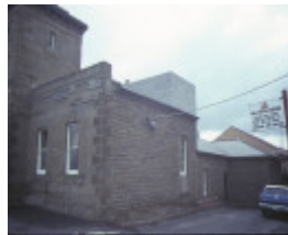
former telegraph station ryrie street geelong side elevation jul1984