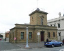
FORMER TELEGRAPH STATION SOHE 2008