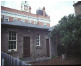
former telegraph station ryrie street geelong rear entry jul1984