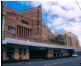
h01524 1 rivoli camberwell front facade