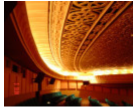
h01524 rivoli camberwell cinema1 detail