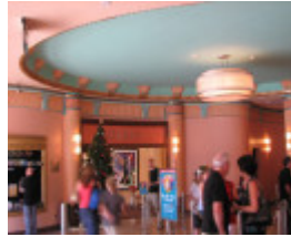
RIVOLI THEATRE SOHE 2008