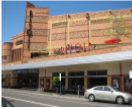
RIVOLI THEATRE SOHE 2008