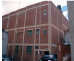
h01524 rivoli camberwell rear3