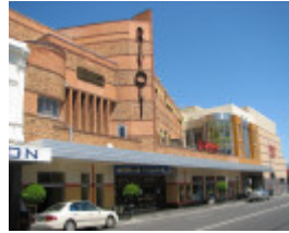
RIVOLI THEATRE SOHE 2008