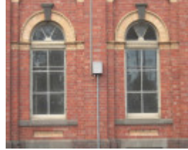
GAS REGULATING HOUSE SOHE 2008