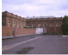
1 gas regulating house macaulay road north melbourne rear view apr1998