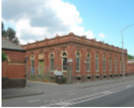
GAS REGULATING HOUSE SOHE 2008